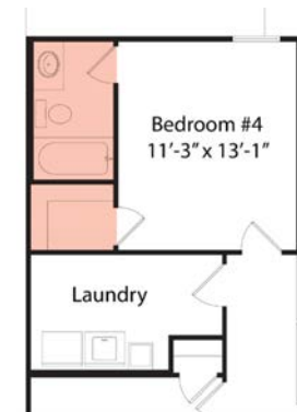
Optional Full Bathroom in Bedroom #4